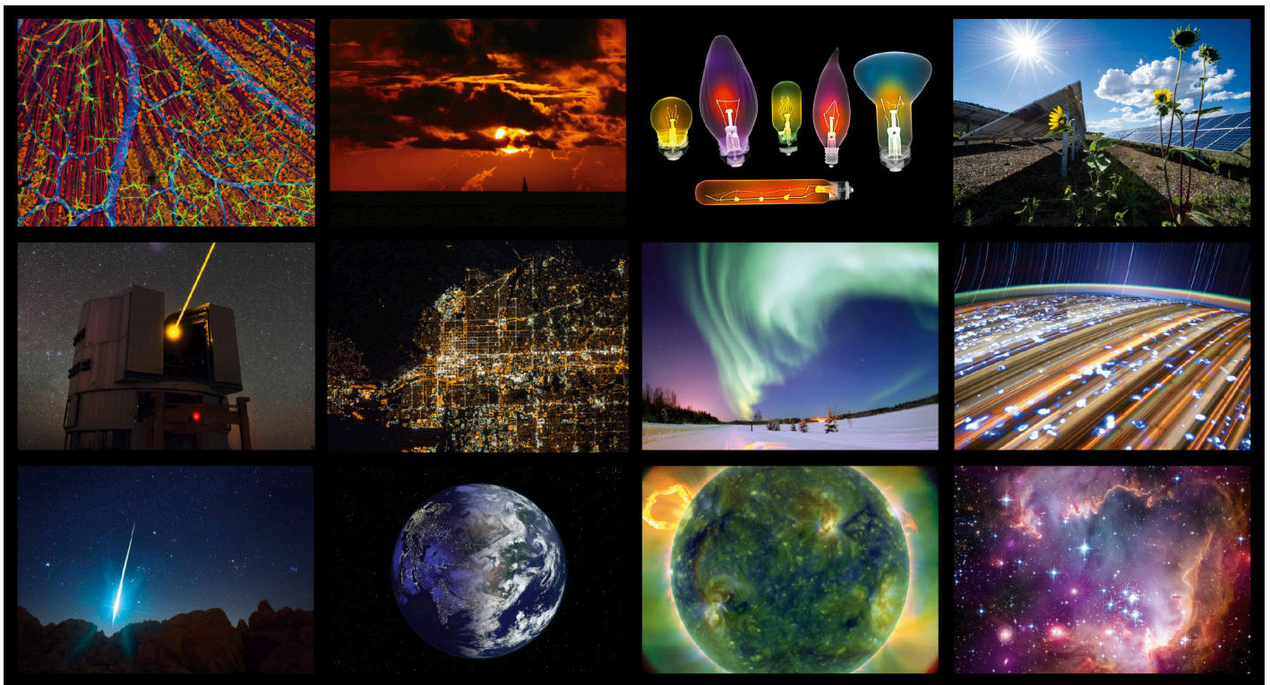
Figure 1. A selection of images from the Light: Beyond the Bulb project, from a mouse retina, to light pollution, to star formation.

Due in part to the opportunity provided by the International Year of Light and Light-based Technologies (IYL2015) 1 a new exhibit called Light: Beyond the Bulb (LBTB) has been developed to help address this knowledge gap and engage non-expert audiences with the capabilities of light. This global initiative was adopted