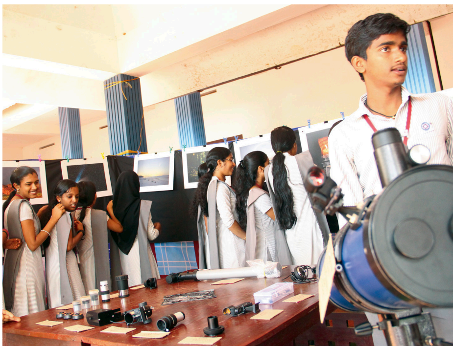
Figure 5. In February 2015, an amateur astronomy organisation created a special event for the Palora Higher Secondary School in India. The exhibition was conducted alongside an inauguration event for a new telescope. Approximately 2500 attendees participated in the exhibition programme to celebrate the International Year of Light 2015. The head of the physics department, MR Sreekumar of Devagiri College Kozhikode, delivered a lecture on light pollution, one of the key topics of IYL2015, and its effects on nocturnal life.