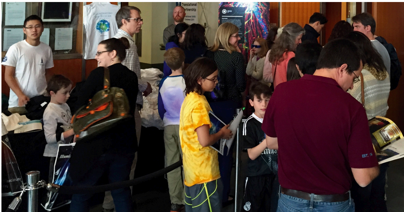
Figure 4. At Duke University in North Carolina, USA, the Fitzpatrick Institute for Photonics Annual Symposium hosted the World Photonics Forum with international speakers as well as an Open House for the greater public. One goal of the event was to help bring together experts and non-experts to discover new ideas about light and light technologies in celebration of IYL2015. Held during the week of 8 March 2015, about 700 people attended, with approximately 500 members representing the public and 200 representing symposium attendees and speakers.