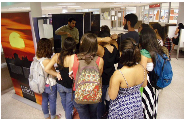
Figure 2. For the month of April in 2015 a Chandra-funded exhibit of Light: Beyond the Bulb was displayed at the main library of the University of Puerto Rico (UPR) and was seen by thousands of people, according to event coordinators. Exhibit tours with hands-on activities on the topics of lensing, shadows, electric discharge, atomic collisions and others were conducted by volunteer physics students. Additional talks, conferences, and other events connected to the exhibit attracted many hundreds of participants. Groups of local school children and their teachers visited from neighbouring towns and university students attended with professors from courses in physics, architecture, art and education.

Networks of science hosts were created through previous projects spearheaded by the Chandra X-ray Observatory Center — including From Earth to the Universe , From Earth to the Solar System , and Here, There & Everywhere 5 — and for this project these were combined with networks from the international society for optics and photonics (SPIE), as well as the International Astronomical Union and others. These networks were used to announce the project, garner programme interest and help promote the events. Tapping into networks of volunteers, has been shown through evaluation of previous projects to be critical to a successful project (Arcand & Watzke, 2013) and was an important