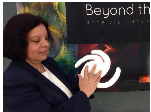
Figure 3. In conjunction with the Light: Beyond the Bulb exhibit events mentioned in Figure 2, on 17 April 2015 an inclusive event on light was held at the University of Puerto Rico for the visually impaired and blind and their families titled Estrellas Para Todos . This activity had 26 participants, including 11 who were blind. Organisers displayed tactile posters on light, plus a tactile Moon, Sun, spiral galaxy and several tactile books including Touch the Sun and Touch the Star .