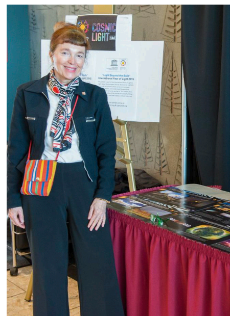
Figure 7. International Astronomy Day 2015 at the Royal British Columbia Museum (Victoria, BC, Canada) was celebrated on 25 April 2015. Organisers collaborated with the Royal Astronomical Society of Canada (RASC) for a daylong event. The hosts provided Light: Beyond the Bulb posters, a monitor displaying images, and a large wall screen displaying more science images. Approximately 750 people attended the event.